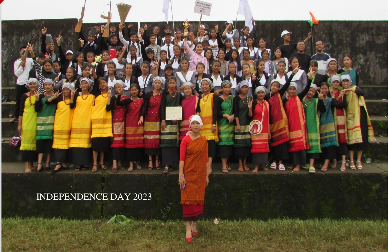
INDEPENDENCE DAY 2023