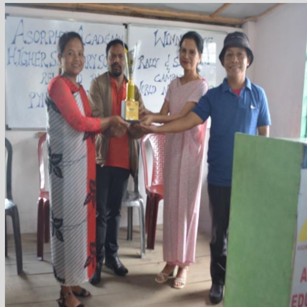
WINNER OF TOBACCO AND SIGNATURE CAMPAIGN AT BLOCK LEVEL