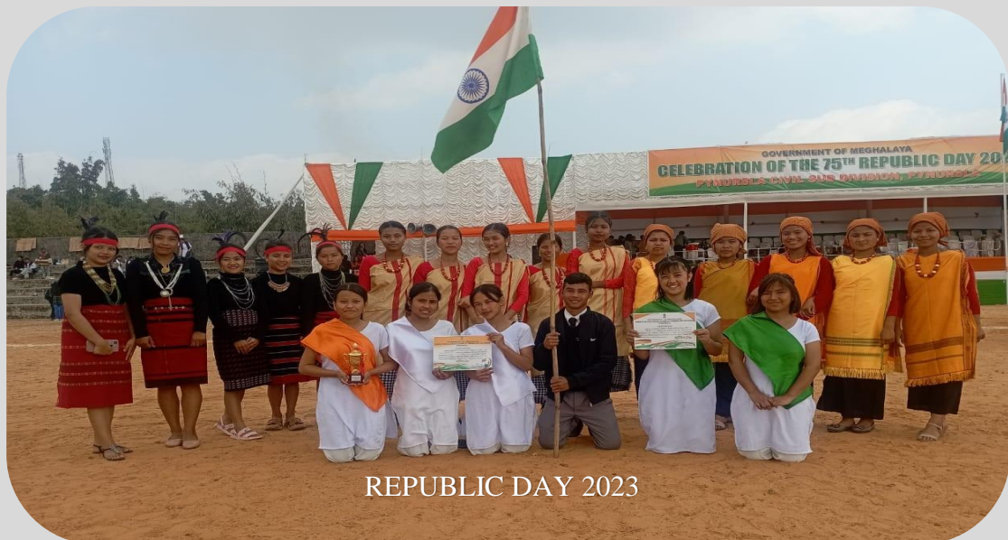
REPUBLIC DAY 2023