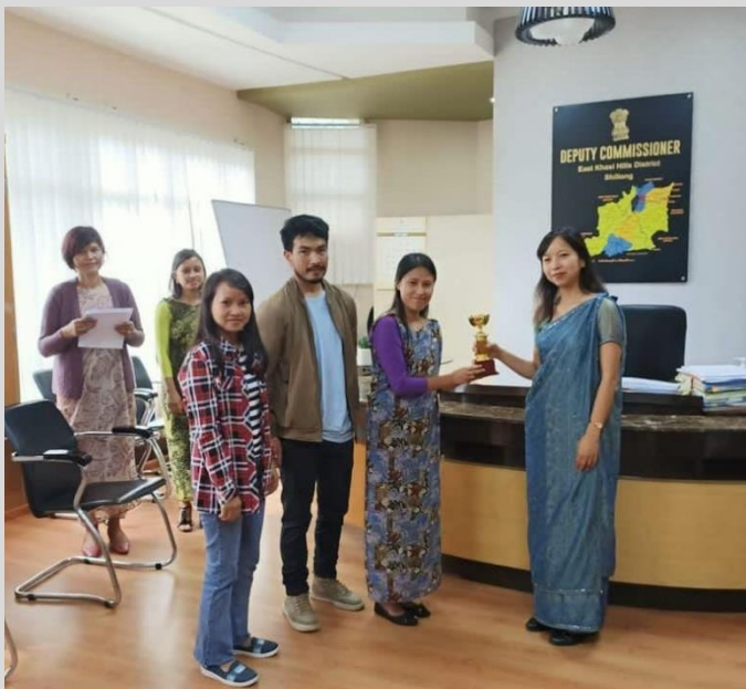
WINNER OF TOBACCO AND SIGNATURE CAMPAIGN AT DISTRICT LEVEL