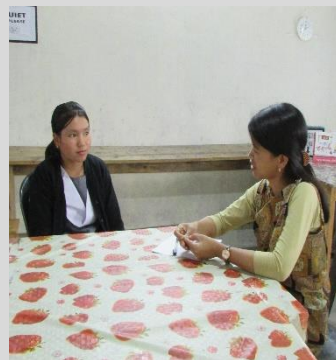
PERSONALITY ASSESSMENT AND SUPPORTING